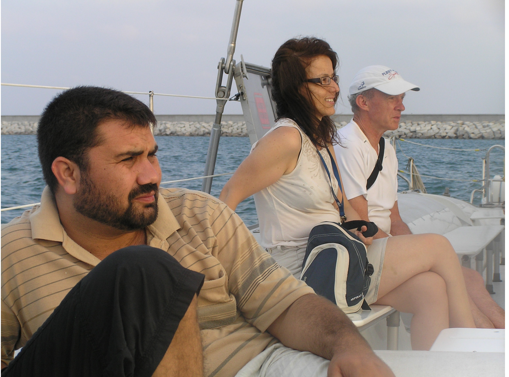
Hard at work in Valencia (July 21, 2010) at PASCOS-2010