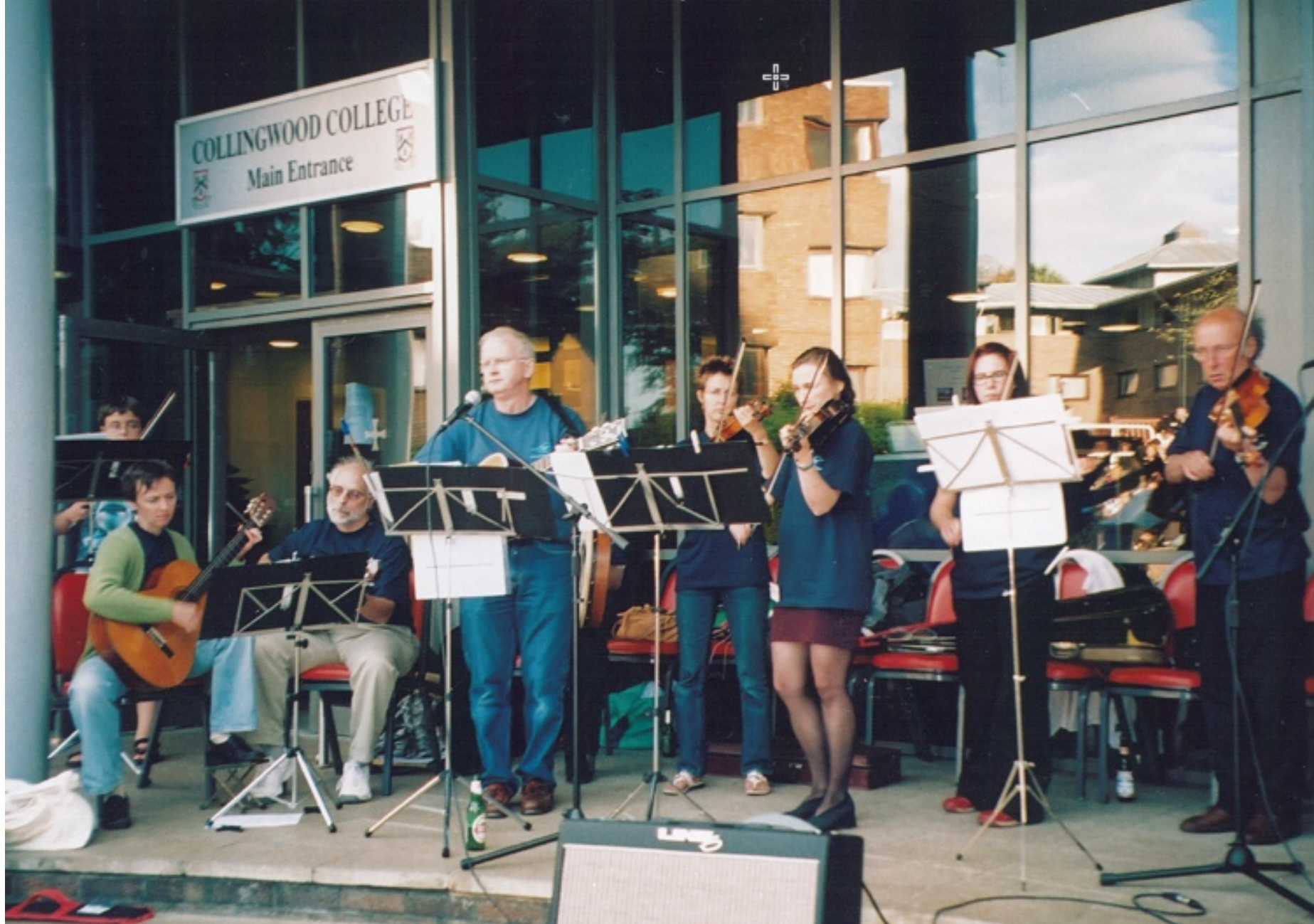
The IPPP Ceilidh Band plays SUSY-2005 (Durham, UK) July 20, 2005