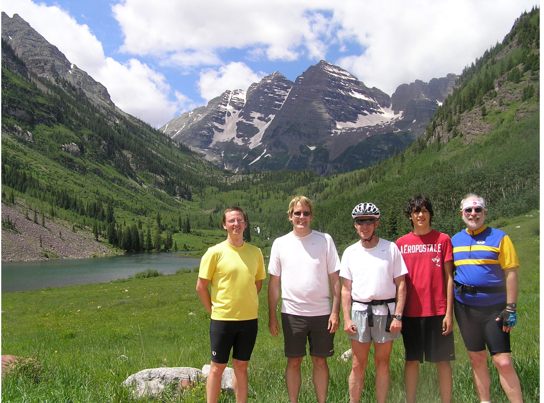
Maroon Lake bicycle ride near Aspen, CO on July 2, 2010