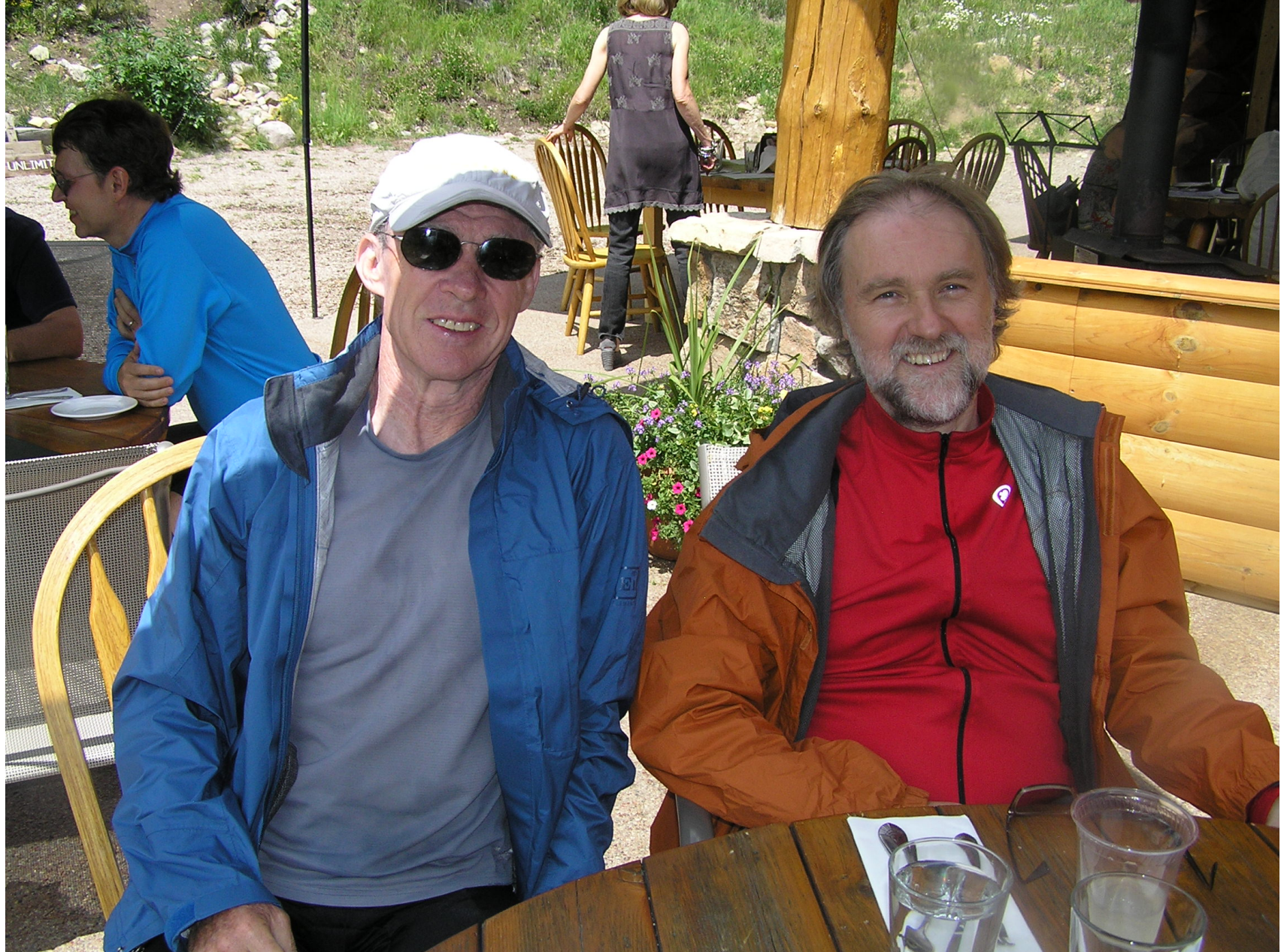
Enjoying lunch après bike (August 8, 2012)