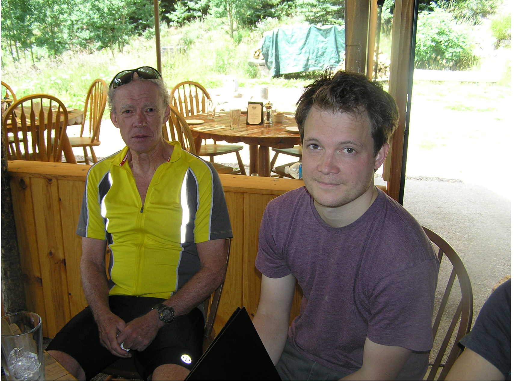
Another Pine Creek Cookhouse lunch