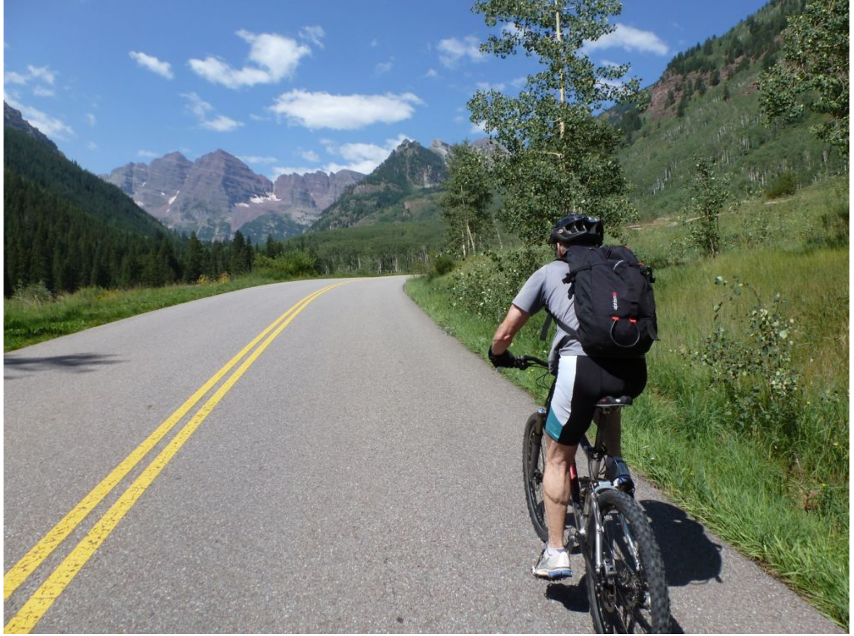
On the way to Maroon Lake (the usual view of fellow cyclists)