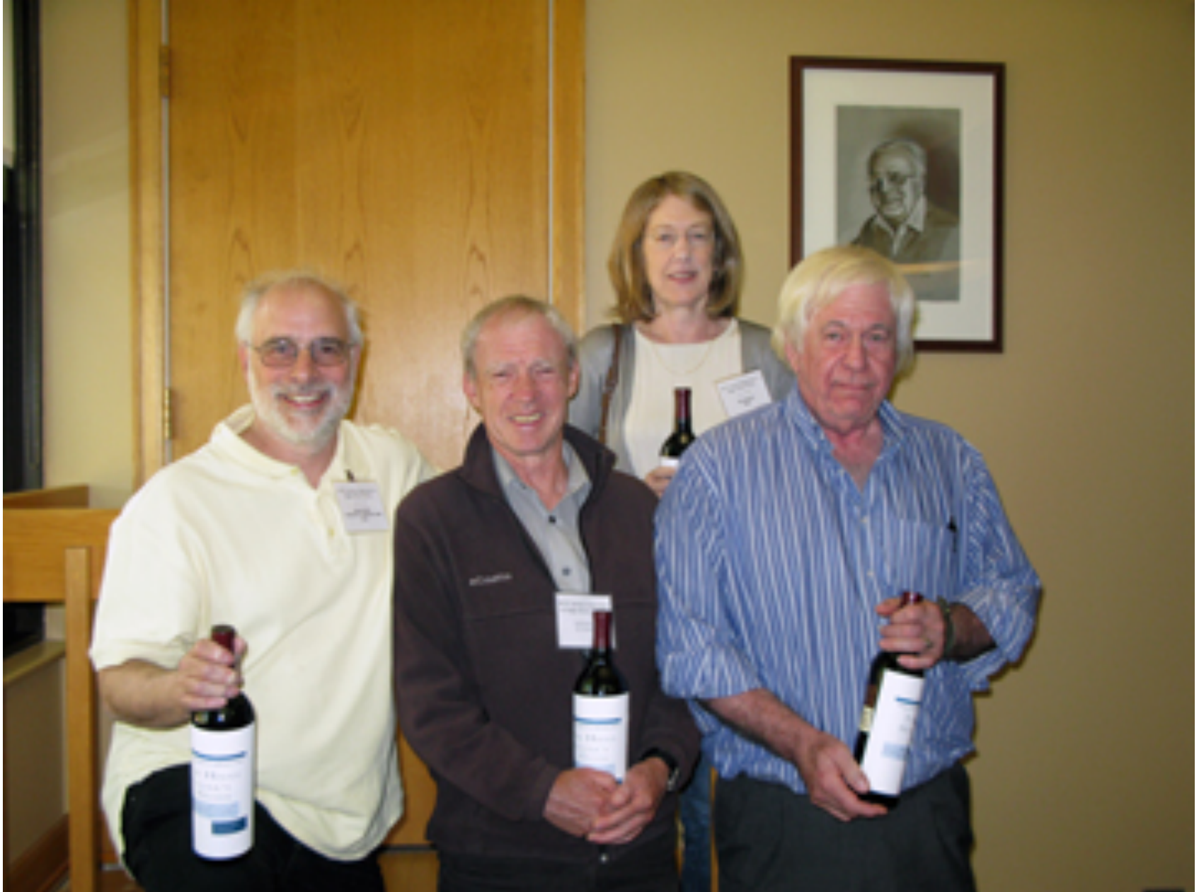
Higgs Hunters at the MCTP Spring Symposium on Higgs Boson Physics in Ann Arbor, MI (May, 2010)