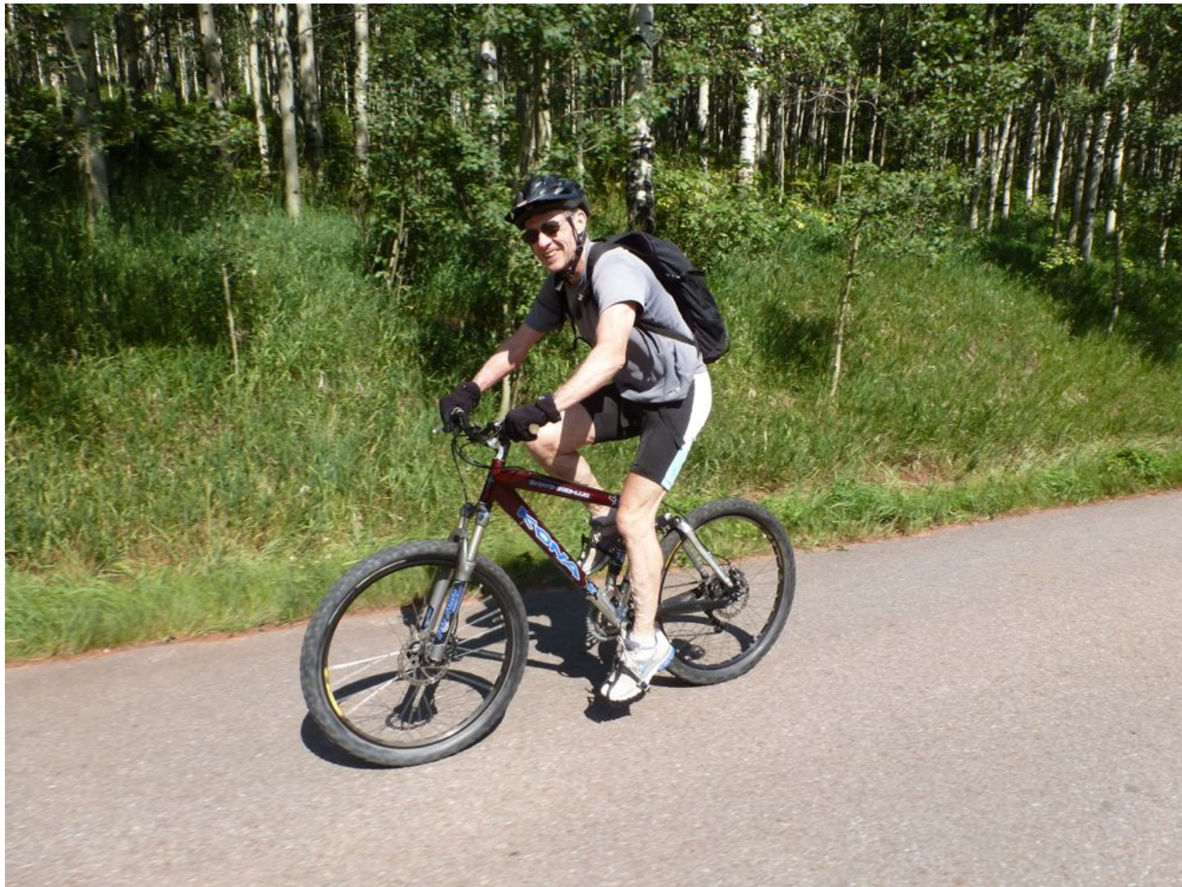
On the way to Maroon Lake on August 24, 2012