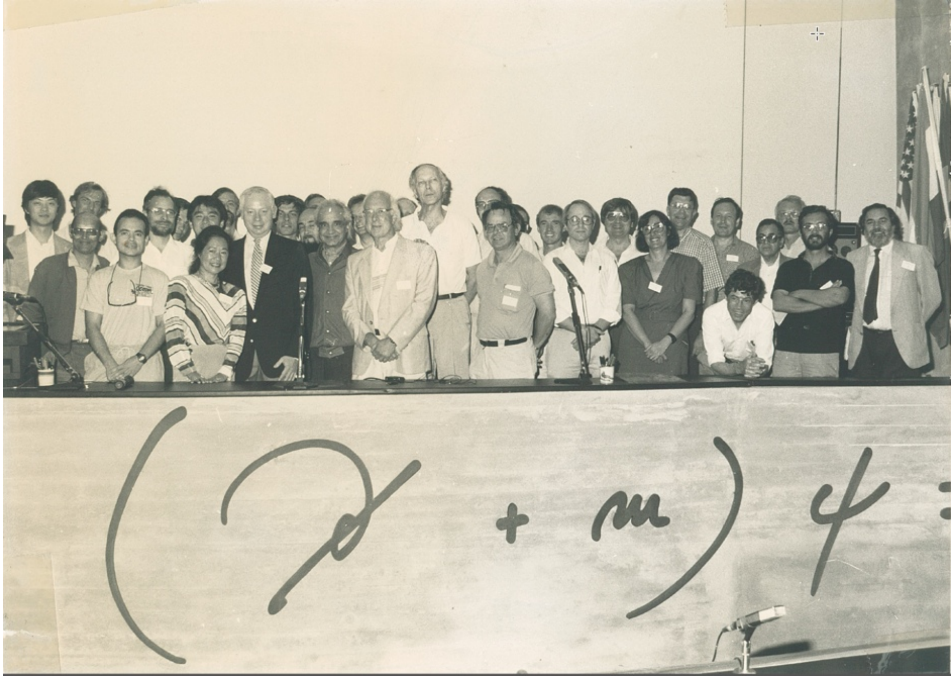
25 th anniversary of the Higgs boson in Erice, Italy (July, 1989)