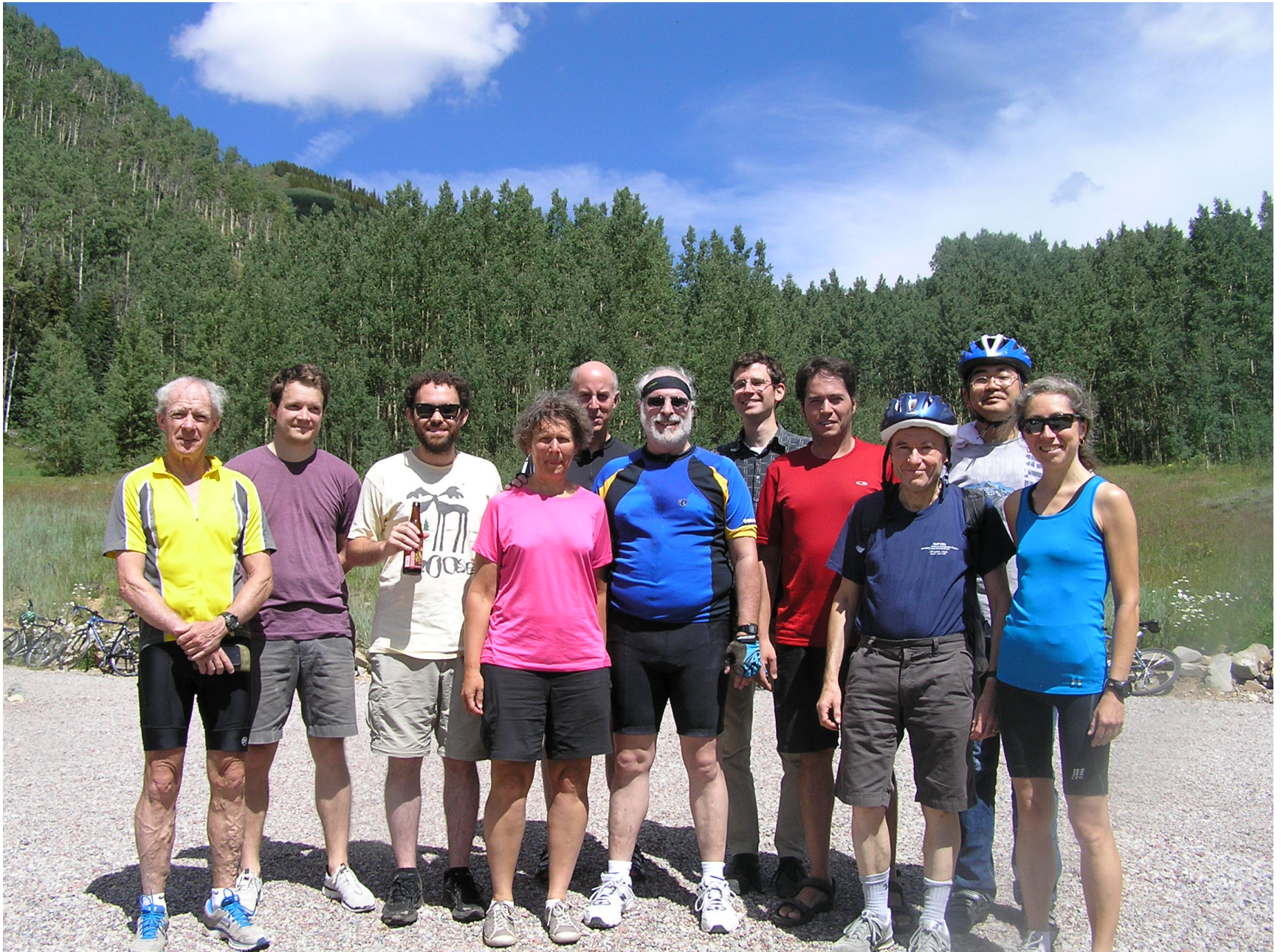
The Pine Creek Cookhouse Ride Redux (August 21, 2013)