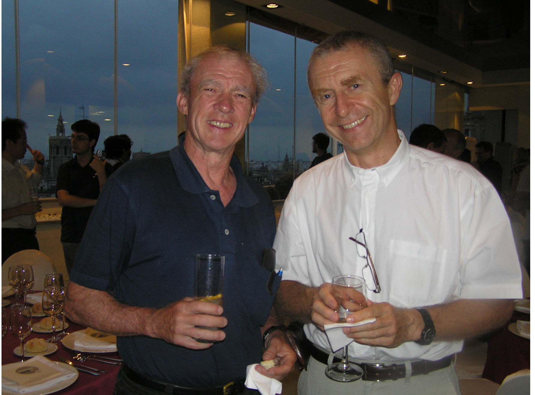
The next evening at the banquet (July 22, 2010 in Valencia)