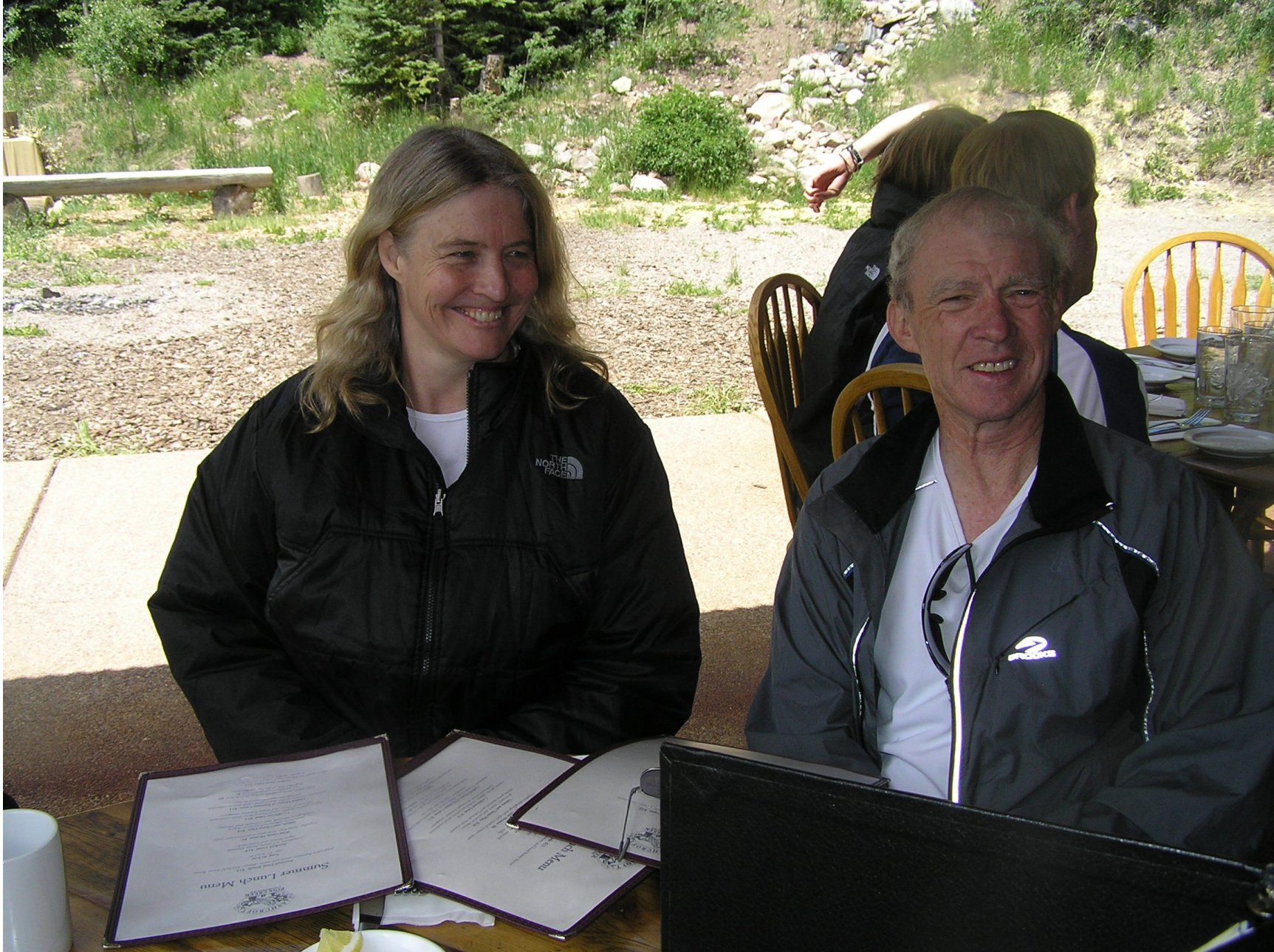
At the Pine Creek Cookhouse in Ashcroft, CO on July 7, 2010