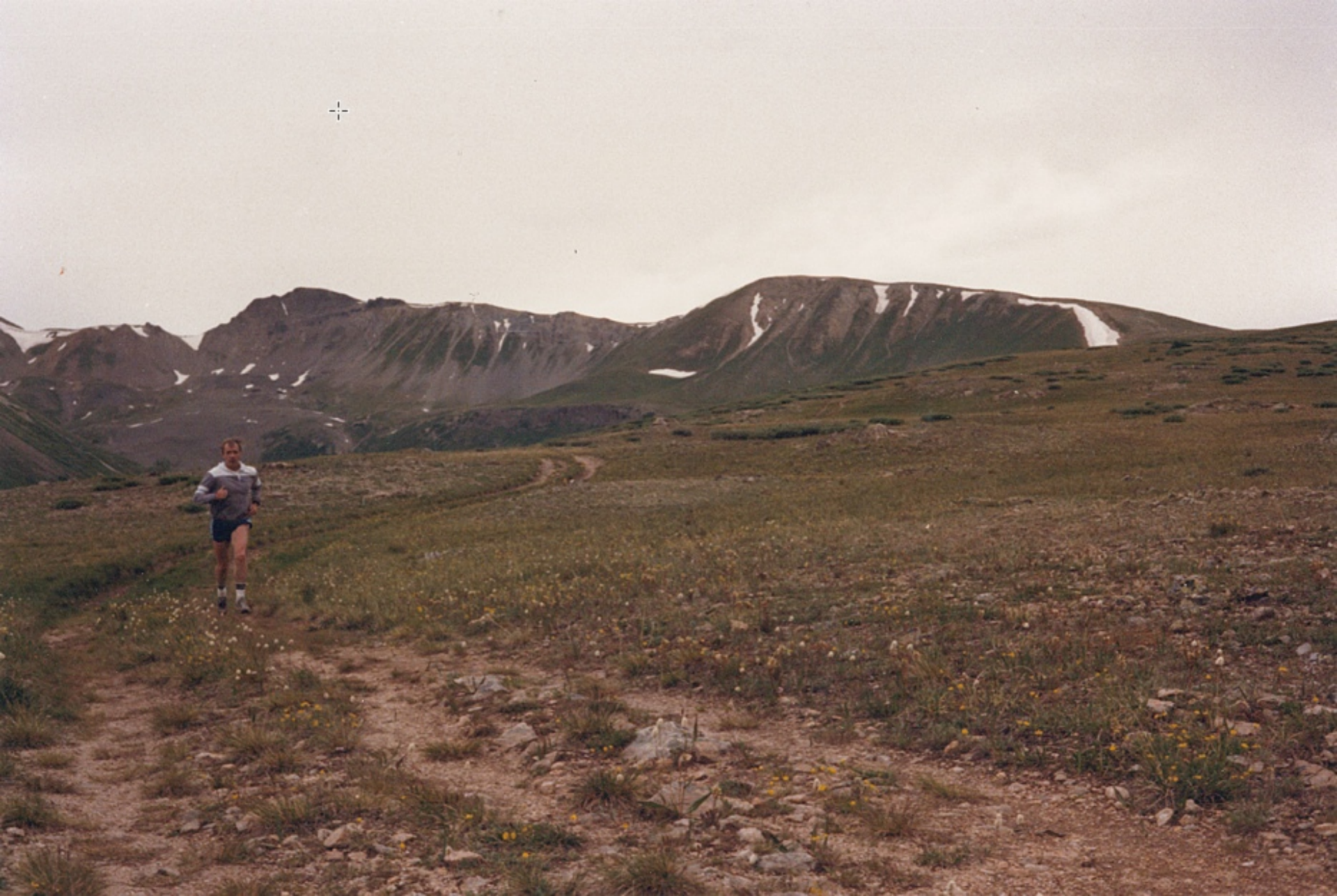
Jack jogging near Independence Pass (July 15, 1988)