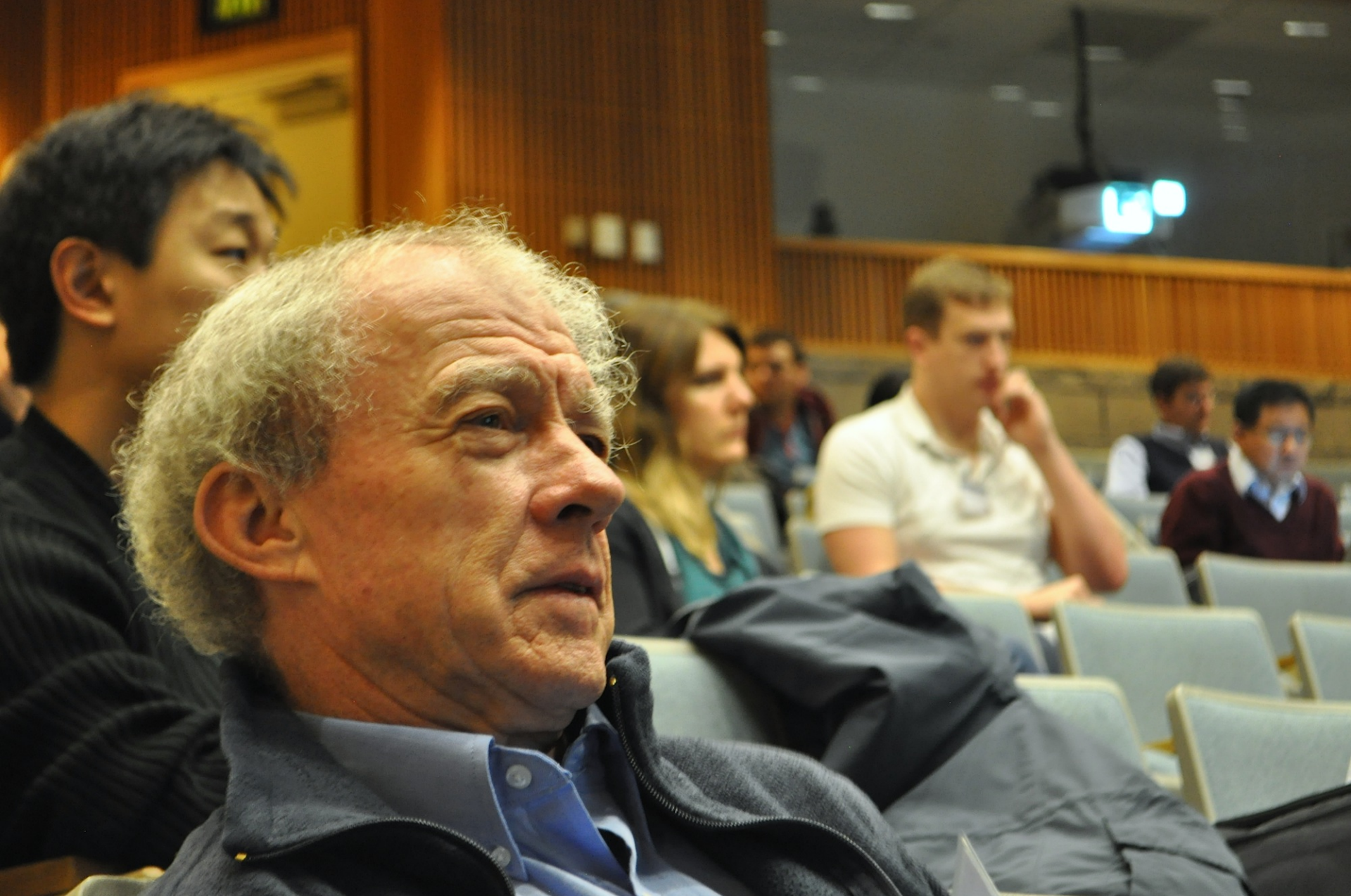
At the Dine/Haber Symposium in Santa Cruz, January 5, 2013