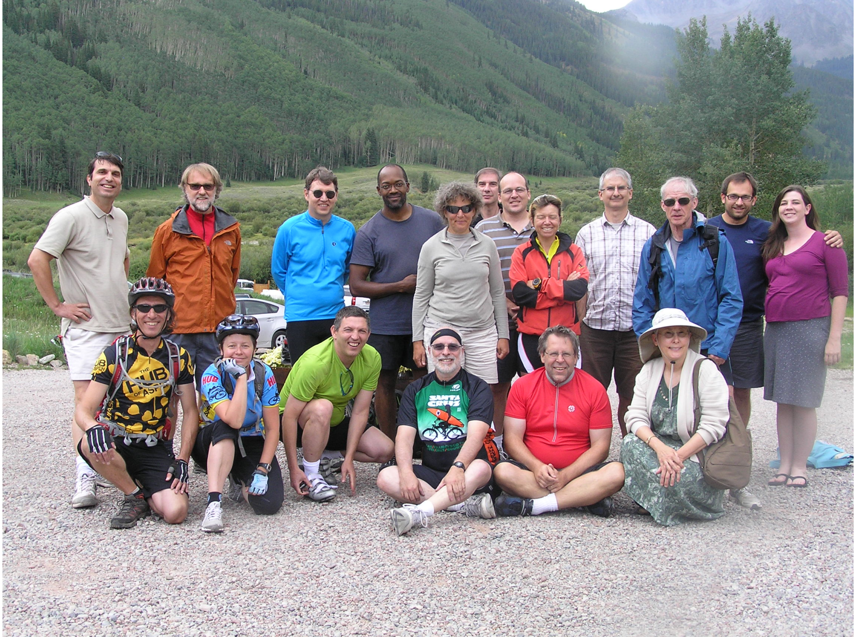
The Pine Creek Cookhouse ride of 2012